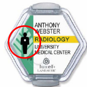
Icon on Badge

Collar Badge (red with dot on neck) Worn at the neck above any shielding Waist Badge (yellow with dot on waist) Worn at belt level under any shielding